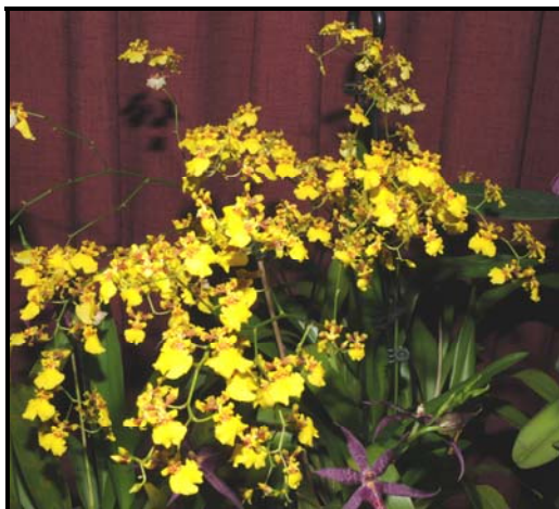
Oncidium Dancing Lady